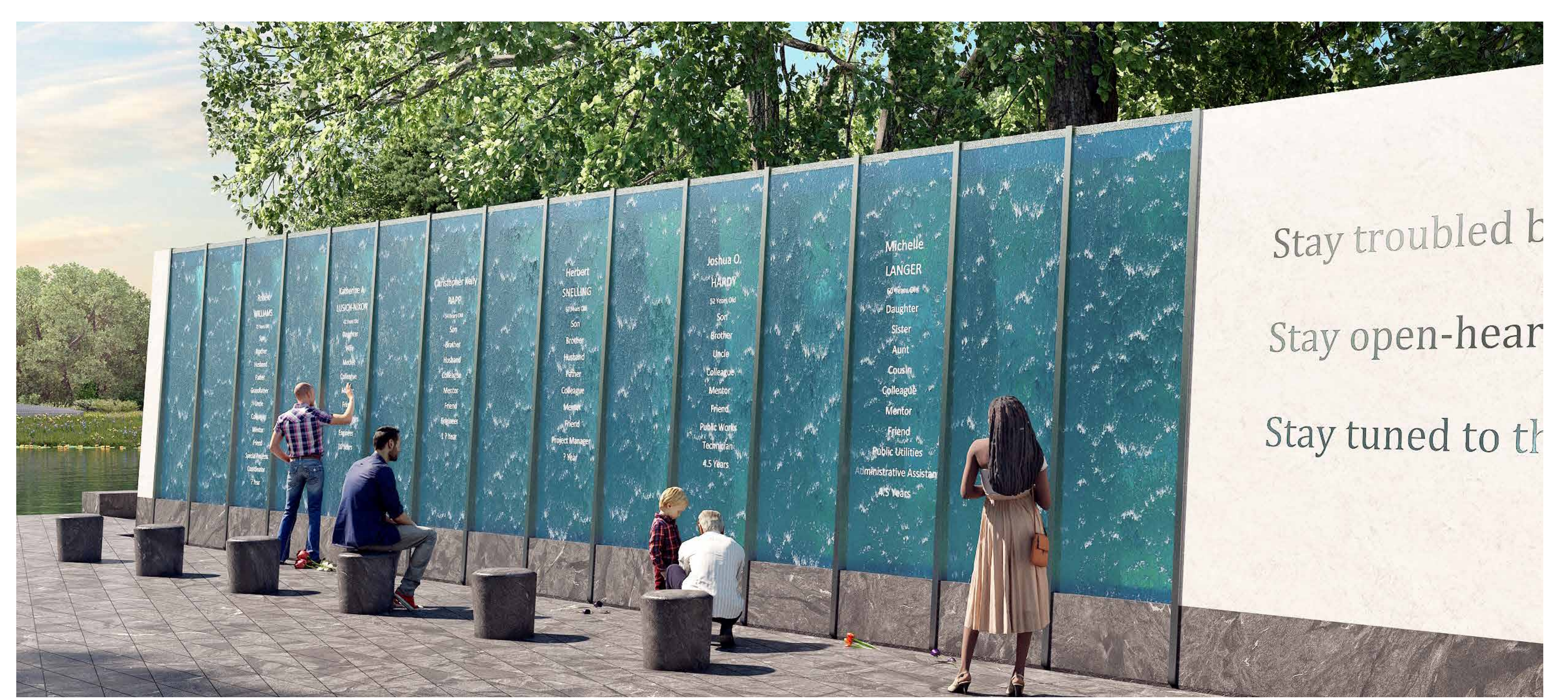
THE MEMORIAL WATER WALL