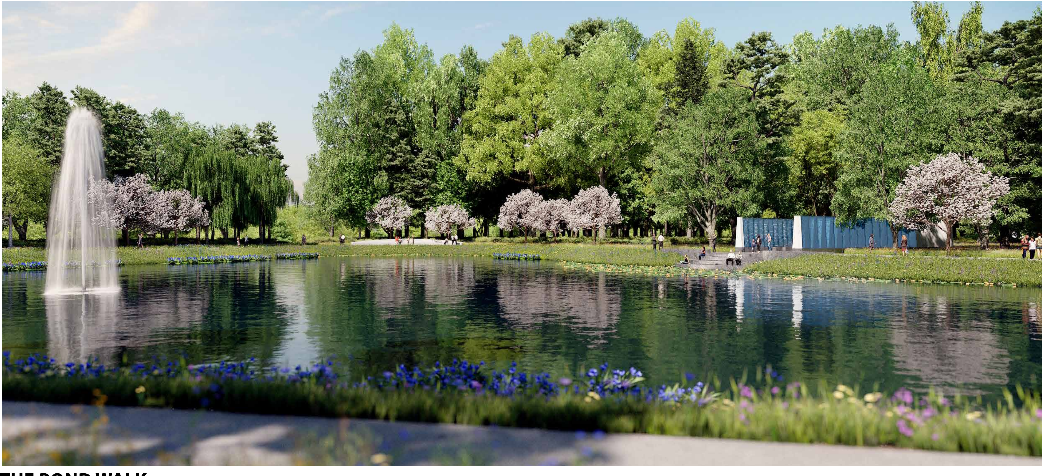
THE POND WALK